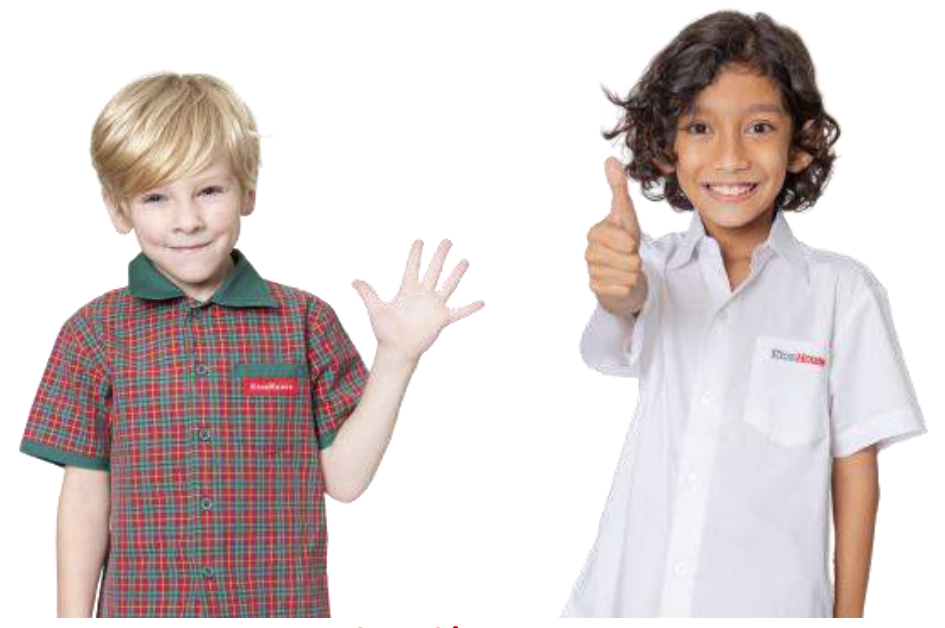
Pre-School* & Primary Inquire.Think.Learn Curriculum IB Primary Years Programme

*Pre-School education available at 11 other campuses islandwide