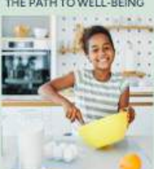
JUNIOR CHEFS: COOKING, CREATIVE WRITING FOR CULTURE AND NUTRITION BEGINNERS: BRINGIN