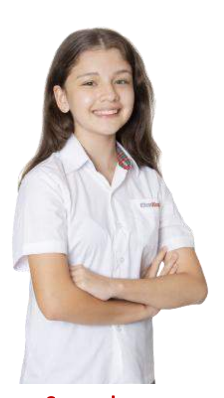
Secondary UK Key Stage 3 IGCSEs