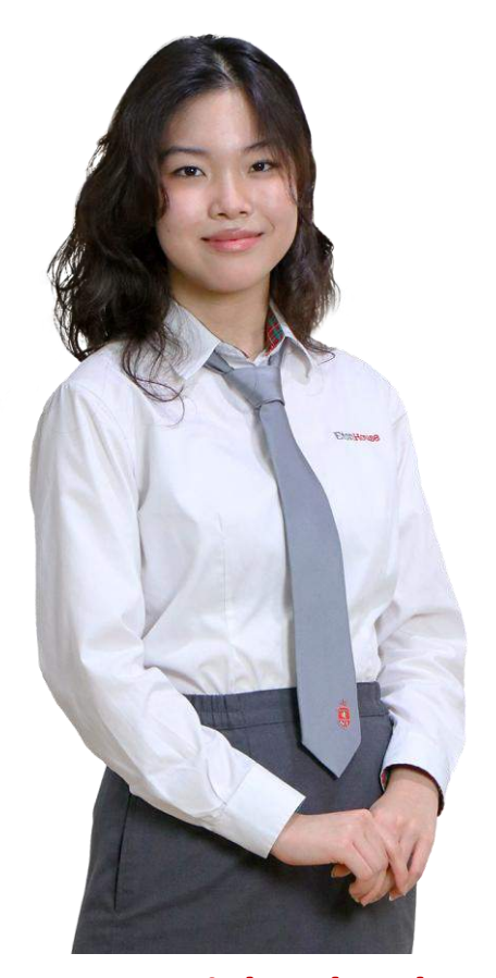
High School International A Level Programme