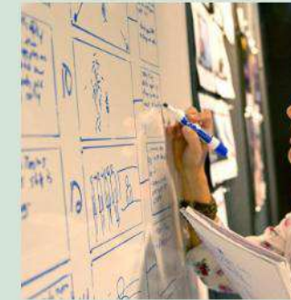
CREATIVE WRITING FOR BEGINNERS: BRINGING YOUR STORY TO LIFE