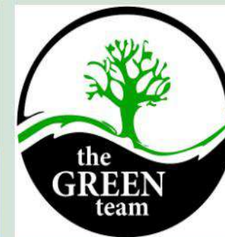
TEAM GREEN: ENVIRONMENTAL SUSTAINABILITY SOCIETY