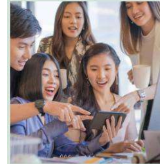
YOUNG BUSINESS BUILDERS