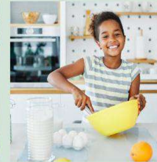
JUNIOR CHEFS: COOKING, CULTURE AND NUTRITION