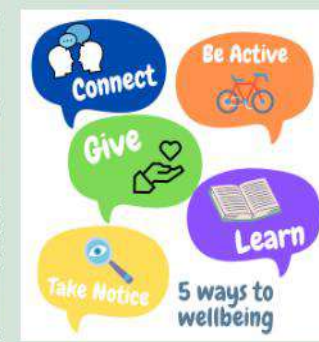
THE PATH TO WELL-BEING