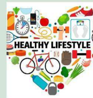
HEALTH HEROES: HEALTH WEEK PLANNING COMMUNITY